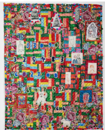
Jakkai Siributr, Hopes and Dreams II (Diptych) , 2008 Courtesy of Artist and Tyler Rollins Fine Art