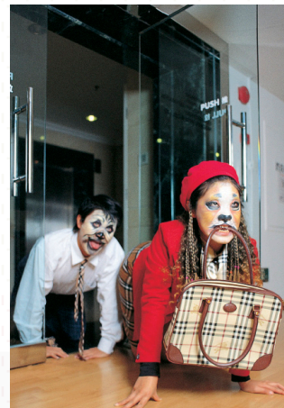
Cao Fei, Dog Days (Rabid Dog Series) , 2002 Courtesy of Artist and Lombard-Freid Projects